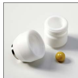
PTFE bowl for use in biotechnology

The ultra-compact FRITSCH Mini-Mill is the ideal assistant for fine comminution of smallest quantities – for wet grinding as well as for dry or cryogenic grinding. Its special, spherical grinding bowl ensures much better performance in grinding, mixing and homogenising compared with similar models. With a footprint of just 20 x 30 cm and a weight of 7 kg, it easily fits anywhere. It's smart, is extremely user-friendly, inexpensive, and convinces with impressive results: small, fast, effective.