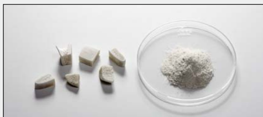
Bone material before and after grinding with the FRITSCH PULVERISETTE 0

For comminution of bones, e.g. for XRF analysis for medication development, we recommend the Vibratory Micro Mill PULVERISETTE 0 with mortar and grinding ball made of zirconium oxide or steel. The special advantage: Gentle sample preparation without development of heat or thermal loads.