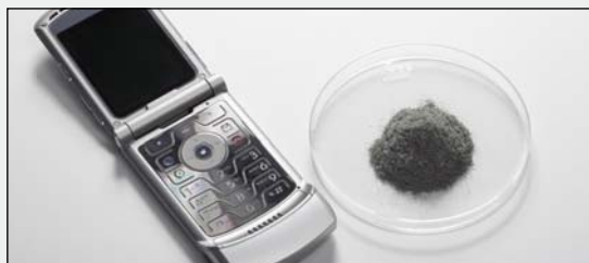
Mobile phone keypad: Grinding results after embrittlement under freezing conditions

For comminution of individual electronic components, such as mobile phones for RoHS analysis, the FRITSCH Vibratory Micro Mill PULVERISETTE 0 delivers very good results – depending on the sample characteristics at room temperature or with cryogenic grinding after embrittlement with liquid nitrogen in the practical FRITSCH cryo-box.