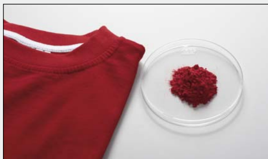
KBr pellets for analysis of fibre samples

For fibre analysis with infrared spectroscopy, the PULVERISETTE 23 provides the ideal preparation of the sample for creation of homogeneous pellets of potassium bromide (KBr). With addition of 20 mg of KBr, the fibre sample is ground to a homogeneous powder in 3 minutes. With an additional 250 mg of KBr that was ground for 90 seconds to a fine consistency in the PULVERISETTE 23, the ground sample is then ground further and homogenised in only 30 seconds.