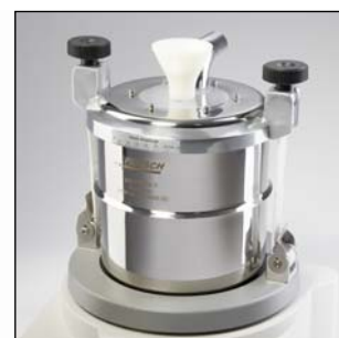
FRITSCH cryo-box for fast, simple embrittlement

The FRITSCH PULVERISETTE 0 is the ideal laboratory mill for fine comminution of medium-hard, brittle, moist or temperature-sensitive samples – dry or in suspension – as well as for homogenising of emulsions and pastes.