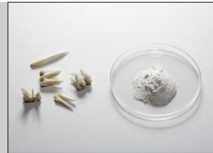
Teeth before and after grinding with the FRITSCH PULVERISETTE 0