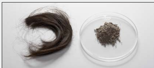
Hair sample before and after grinding with the FRITSCH PULVERISETTE 23

For fast and simple preparation of hair samples for analysis for drug traces, roughly 300-500 mg of hair can be ground to a fine powder (< 100 \mu\text{m} ) in just 5 minutes in the FRITSCH Mini-Mill PULVERISETTE 23 using a 15 mm steel ball in a 15 ml steel bowl.