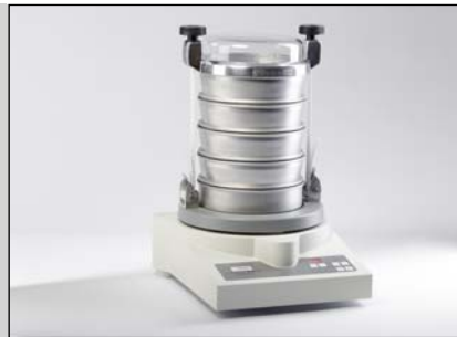
Grinding and sieving in one unit: the PULVERISETTE 0 as ANALYSETTE 3 SPARTAN