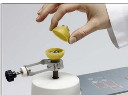
Practical and effective: Spherical grinding bowls for easy assembly