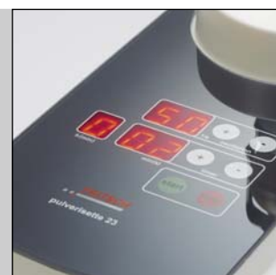
Operating panel with integrated, easy-to-clean glass keyboard