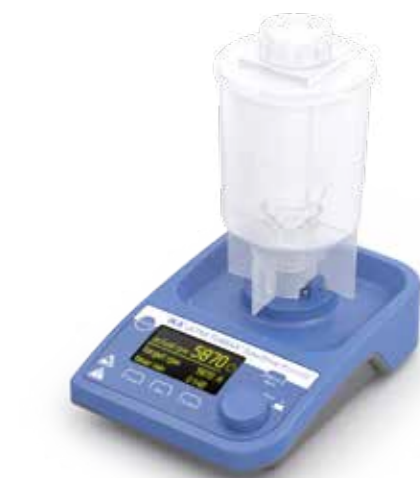
ULTRA-TURRAX® Tube Drive Power control Ident-No.: 0025005981