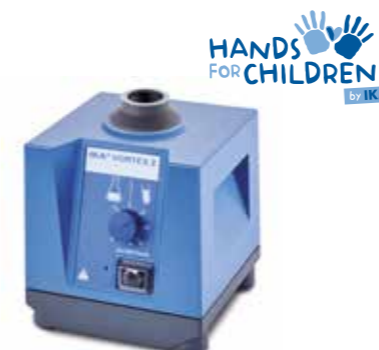
VORTEX 3 Ident-No.: 0003340000