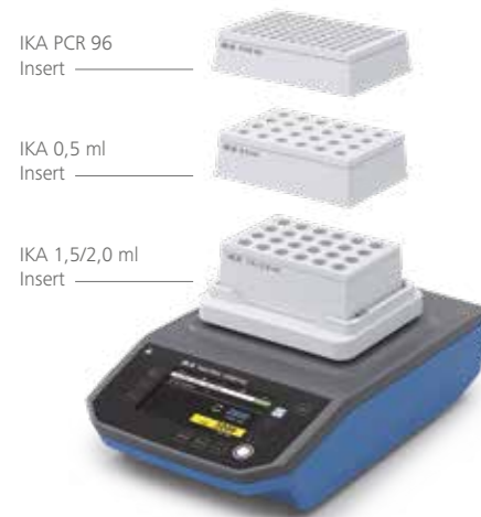
Matrix Orbital Ident-No.: 0030000627

Our goal is to always offer you not only the highest quality devices, but also perfect laboratory solutions. And whoever uses pipettes for dispensing also needs ...