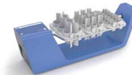
Trayster basic Ident-No.: 0004005000