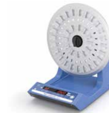
Loopster digital Ident-No.: 0004016000