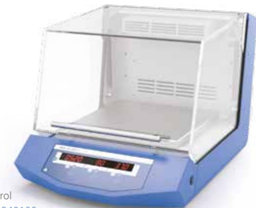
KS 3000 ic control Ident-No.: 0003940100