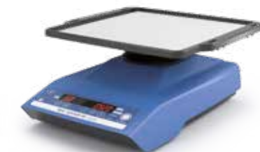
ROCKER 3D digital Ident-No.: 0004001000