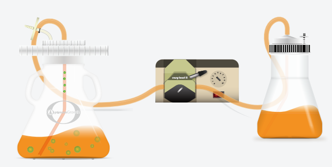
Filter using Rapid Clear<sup>®</sup> Cap 3000 from one Optimum Growth<sup>™</sup> 5L Flask to a 2.8L Optimum Growth<sup>™</sup> Flask for storage

Filter using Rapid Clear® Cap 3000 from one Optimum Growth<sup>™</sup> 5L Flask to another 5L Flask