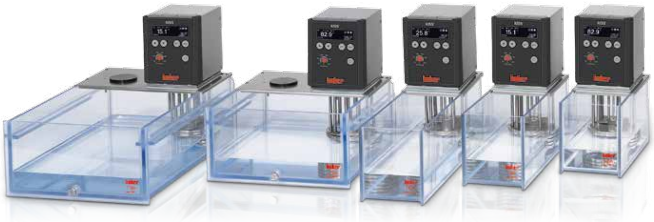
Fig. 4: KISS-baths are available in transparent polycarbonate or stainless steel. The range of volumes is from 6 to 25 litres.

automatic cooling capacity adjustment that reduces the energy consumption and the waste heat to a minimum. The finishing touch to the range is a range of useful accessories like test tube inserts, platforms, bath covers, probes, hoses and temperature control liquids.