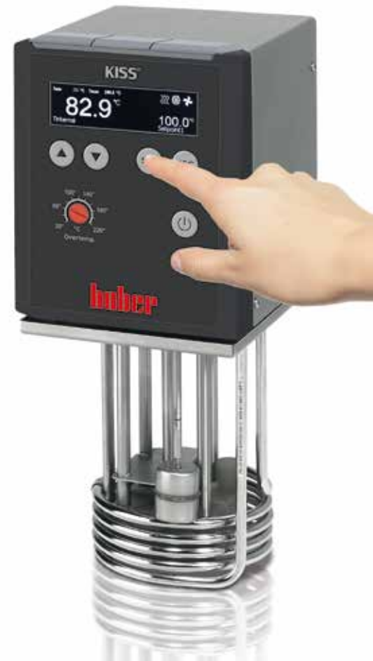
Fig. 2: The new OLED display shows all important data clearly: setpoint value, actual value, temperature limits as well as status of the pump, heating and cooling systems.

The KISS range comprises an immersion circulator with screw clamp as well as different baths. The baths are available either in transparent polycarbonate (up to +100 °C) or high-grade stainless steel (up to +200 °C). The filling volume of the baths is from 6 to 25 litres, depending on the model. For cooling applications we offer cooling circulators for working temperatures down to -30 °C. As standard, these models already work with natural refrigerants and are therefore friendly to the environment and climate. Additionally, the cooling machines have an