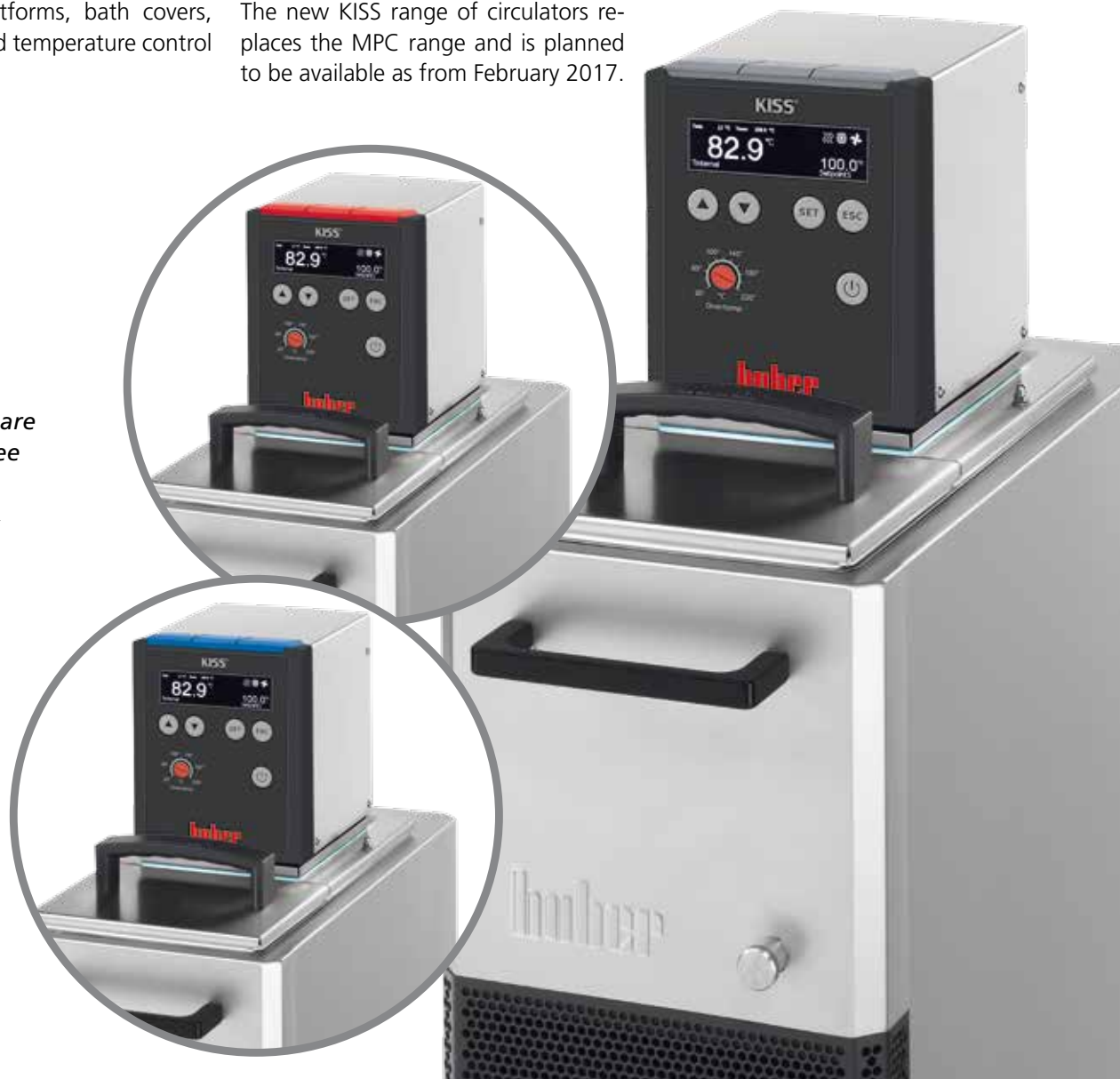
Fig. 5: KISS circulators are available in three colour options: grey (standard), red and blue.

The new KISS range of circulators replaces the MPC range and is planned to be available as from February 2017.