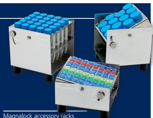
Magnalock accessory racks